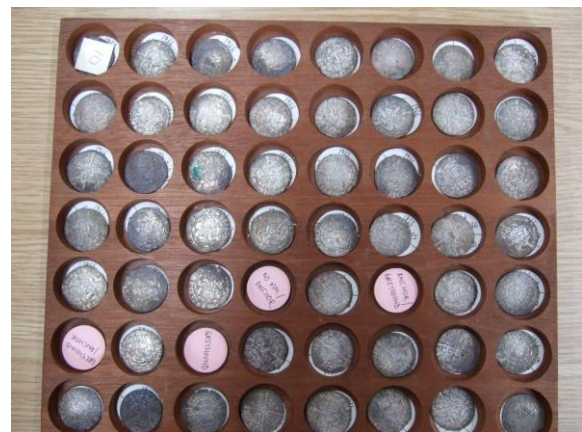
A DRAWER FROM THE CABINET SHOWING A SELECTION OF THE COINS