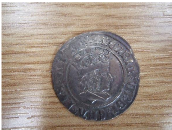
SILVER GROAT OF HENRY VII