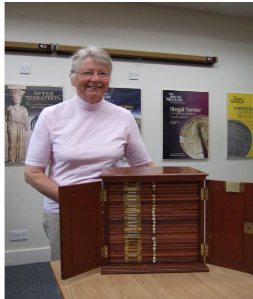
THE CABINET CONTAINING THE HOARD