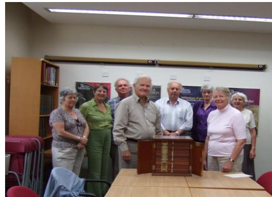
MEMBERS OF THE CONSERVATION GROUP AT THE BRITISH MUSEUM