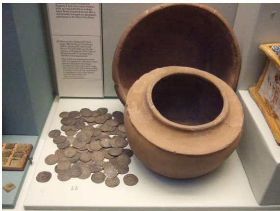
ORIGINAL POT REPAIRED, ON DISPLAY GALLERY 68, CASE 11