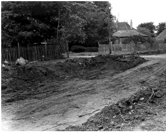
THE EXCAVATION SITE NOW LONGSTAFF WAY